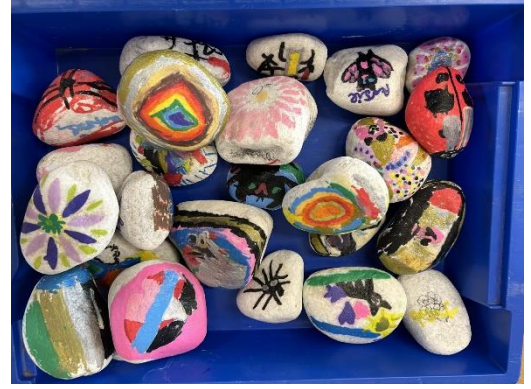
Y2 Stones to add to our school boat